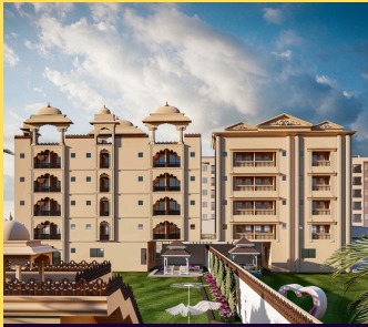
Celebration Suits Vadodara

Investing in Our Premium Project: The Competitive Price Point Advantage