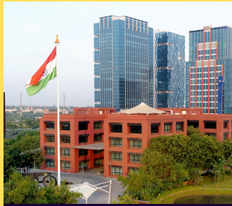
90 LAKH GIFT CITY