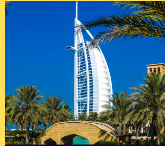
2.5 Cr. DUBAI