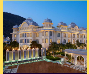
1.5 Cr. UDAIPUR

Our company's premium project stands out as an exceptional investment opportunity due to its unique price point strategy.